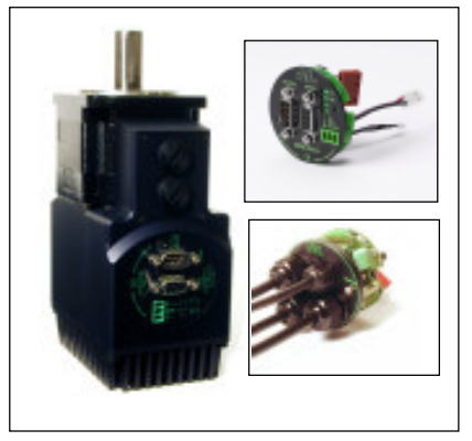
Expansion modules adapt the motor to the specific application

The motor itself is a very powerful, compact, 3-phase AC servo motor that can yield up to 3.9 and 6.8 Nm peak torque. The motor construction is extremely compact, measuring only 175x115x80mm (750W model), which